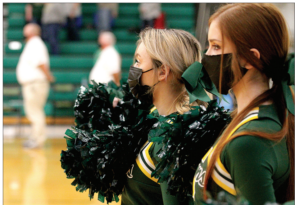
Cheerleaders stand at attention for the National Anthem in a uniform line.