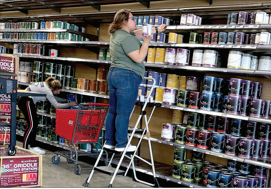
Employees reworked the wall of paint Monday afternoon. The wall, filled with the high end Benjamin Moore paint, is visually pleasing upon entrance.