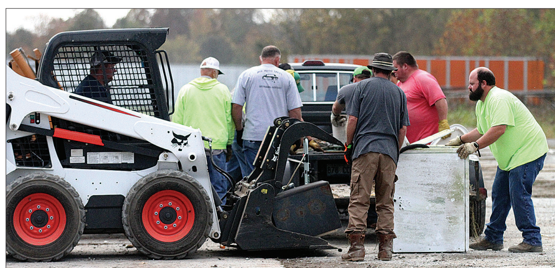
The 2021 White Goods Amnesty Program kicks off tomorrow on Columbia Highway, in the lot adjacent to Access Cable. Items accepted include appliances, furniture, batteries and various types of scrap metal.

"This is a great opportunity for Spring Cleaning and we are proud to be able to offer this service to the Community!" Frank said.