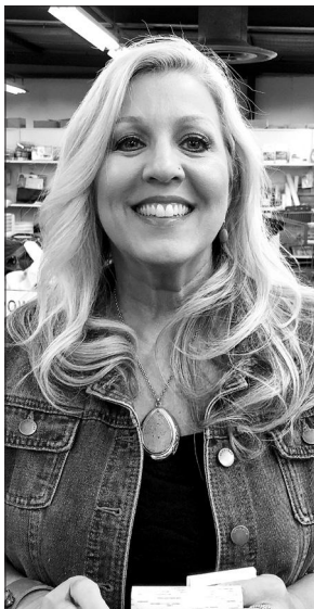
“A deluxe hamburger with crinkle fries.” ——Jennifer Tucker