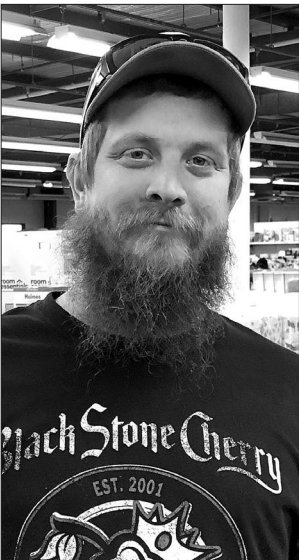
“Any kind of steak with a loaded baked potato.” ——Zane Edwards