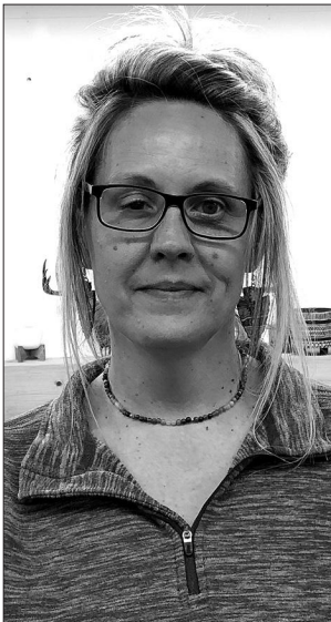
“Filet mignon.” ——Cindy Thompson