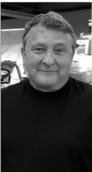
“Roast beef wit gravy and mixed vegetables.” ——Tim Collard