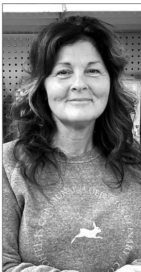
“Chuck roast in an instant pot after I brown each side and I cook it all night. Garlic bulbs, cream of mushroom, onion and onion powder with some sea salt.” ——Linette Cox