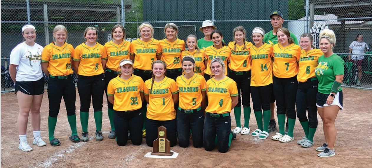
The Green County High School Lady Dragons won their third consecutive district championship last week at home. They defeated Caverna 18-0 in three innings in the semi-finals and LaRue County 10-0 in five innings in the finals.