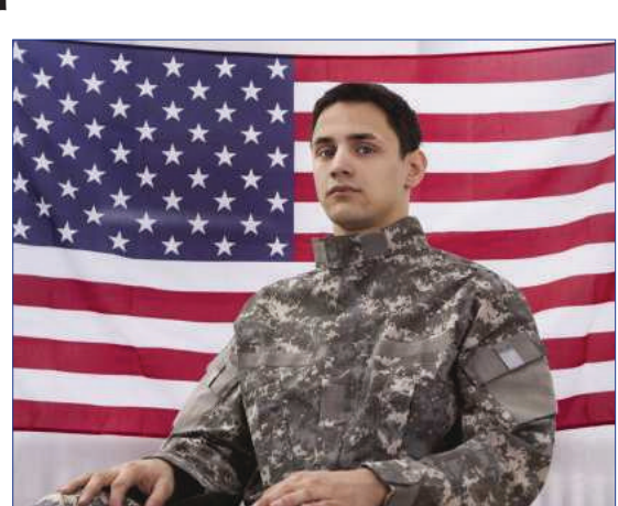
Salutes can include the name of your veteran, their branch and rank as well as a personal message.

Say thank you to the Veteran in your life by placing ad saluting them in our Veteran's Day issue.