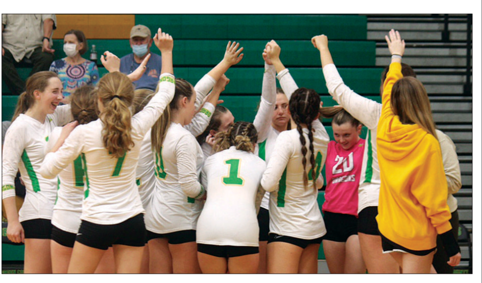
The Lady Dragons played hard but fell short to the Central Hardin Bruins (3-0) on Senior Night October 5.