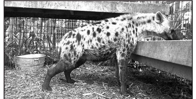
Exotic Creatures - Charlie the hyena is among many sights at the Florida International Teaching Zoo Exhibit.