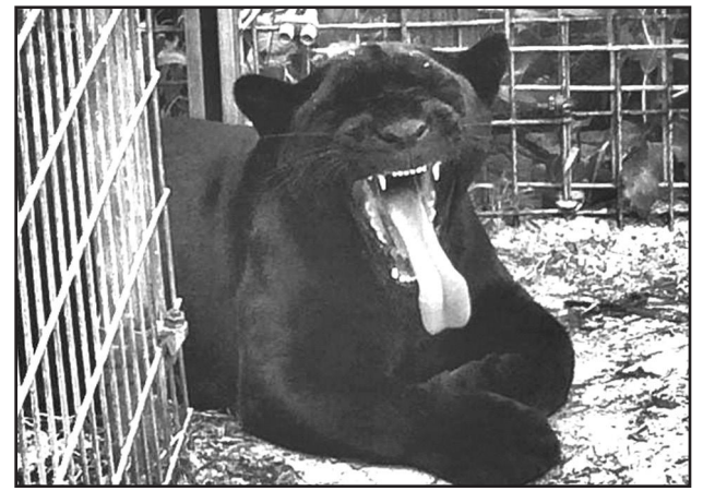
Time For A Nap - An exotic Inca yawns at a Florida International Teaching Zoo Exhibit.

For more information visit their Facebook page or www.floridazooschool.com , or leave a message on the Zoo Tour recorder 866-937-1115.