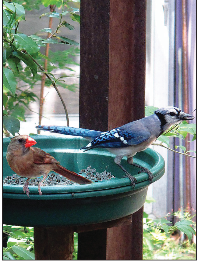
Easy bird feeder

to fall off, in spite of it This time of year, easi- daily chore. going around and around est way to pry kids for a minute or two from their for young children is flat platform feeders two). But for a couple ing questions to rushing-