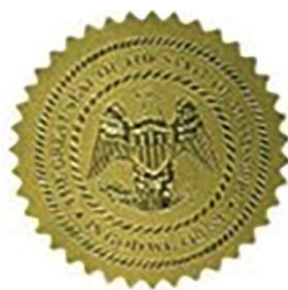
TATE REEVES GOVERNOR August 5, 2021 1:25 P.M.

DONE at the Capitol, in the City of Jackson, this the 5 th day of August, in the year of our Lord, two thousand and twenty-one, and of the two hundred and forty-sixth year of the United States of America.