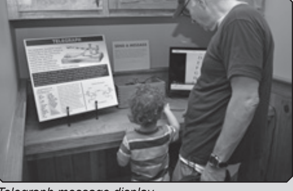
Telegraph message display