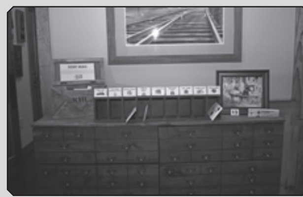
Mail sorting display