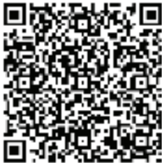
CJHS FB Group