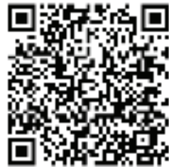
CJHS Spirit Store