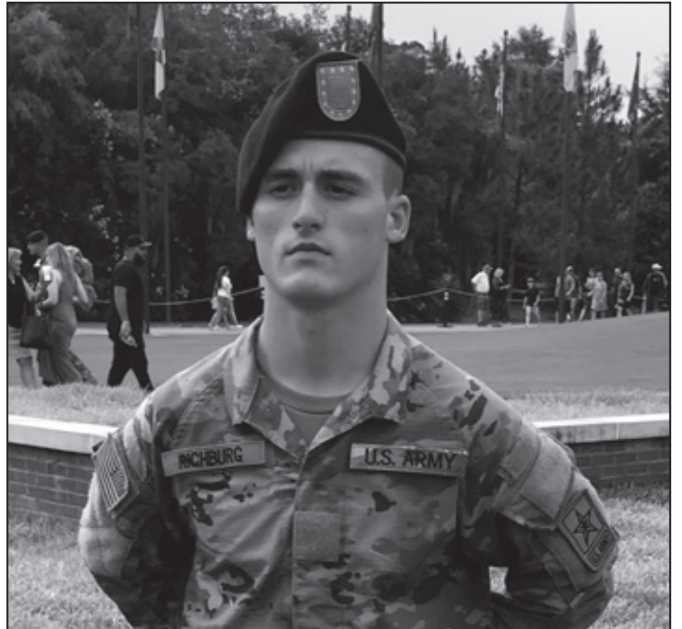
Special to The Clinton Courier