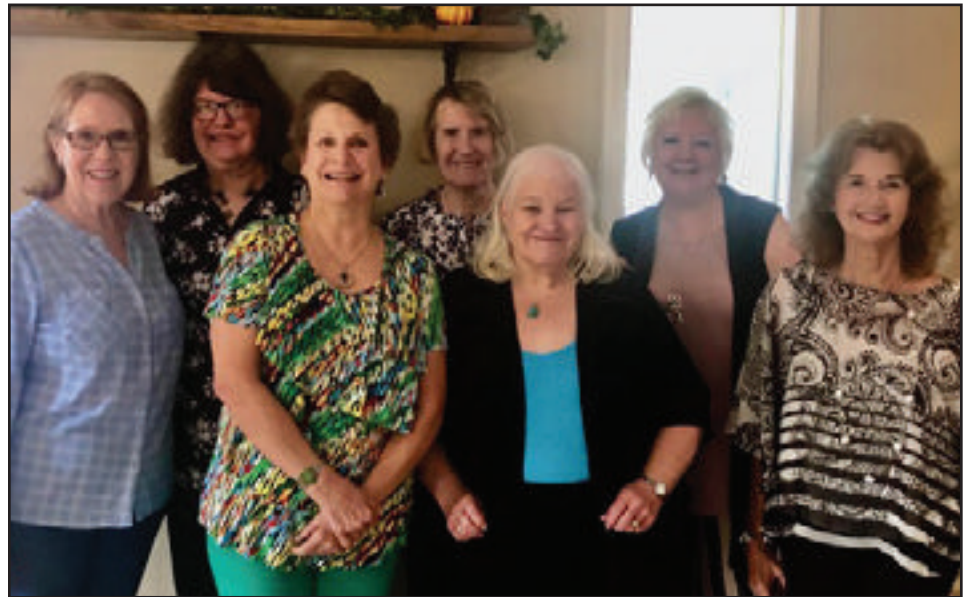
Special to The Clinton Courier