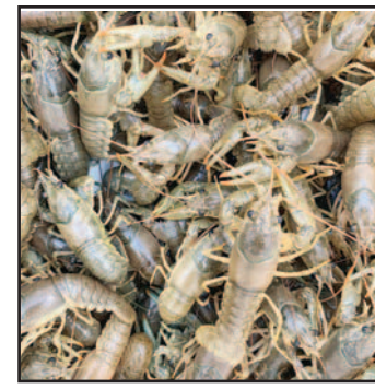
Ozarks Fisheries crayfish.

For more information and to learn more about Ozark Fisheries, please visit www.ozarkfisheries.com . They can also be found on Facebook and Instagram.