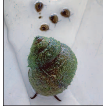
Ozark Fisheries trapdoor snails.

Now 95 years later, Ozark Fisheries raises rosy red minnows, feeder goldfish, and an assortment of ornamental fancy goldfish--