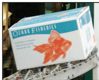
Ozark Fisheries shipping box.

Fun fact: when a need for lighter-weight shipping came