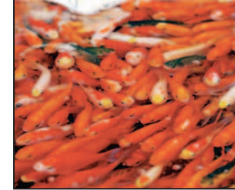
Feeder goldfish in Ozarks Fisheries holding tank.

Ozark Fisheries is located at 1100 Ozark Fisheries Road, Stoutland, MO 65567.