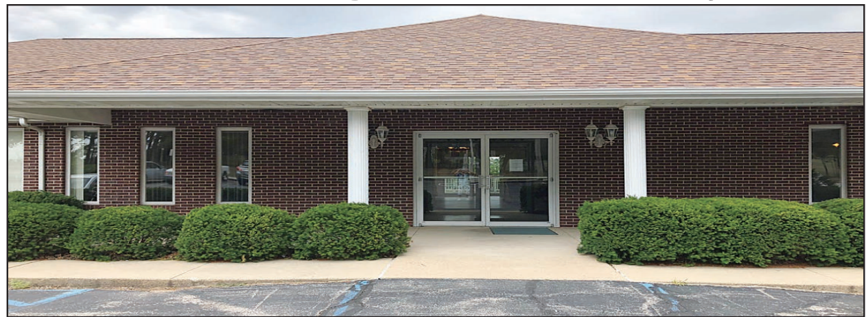
The Dixon Senior Center will re-open for indoor dining on Monday, May 3rd.

The Dixon Senior Center will be Re-Opening with indoor dining on Monday, May 3rd. Everyone age 60 and over is encouraged to come and enjoy Home Cooked Meals daily Monday through Friday. Soup, Salad and Beverage will be served between 10:30 a.m. and 11:00 a.m. each day. Hot Meals, including Desserts and Beverage will