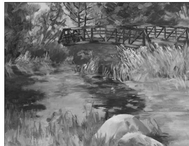
Black Bear Bridge , oil on linen, 11x14 by Ann Waisbrot, Thunder Hill Studio, St Germain