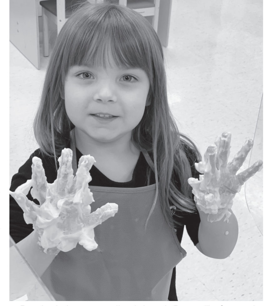
Preschool classes are offered through Barnesville Community Education. There are two different levels offered, Junior Preschool and Senior Preschool.

All of the preschool classes are open to residents of ISD #146 and then if there are openings we would open spots up to families that plan to open enroll to Barnesville.