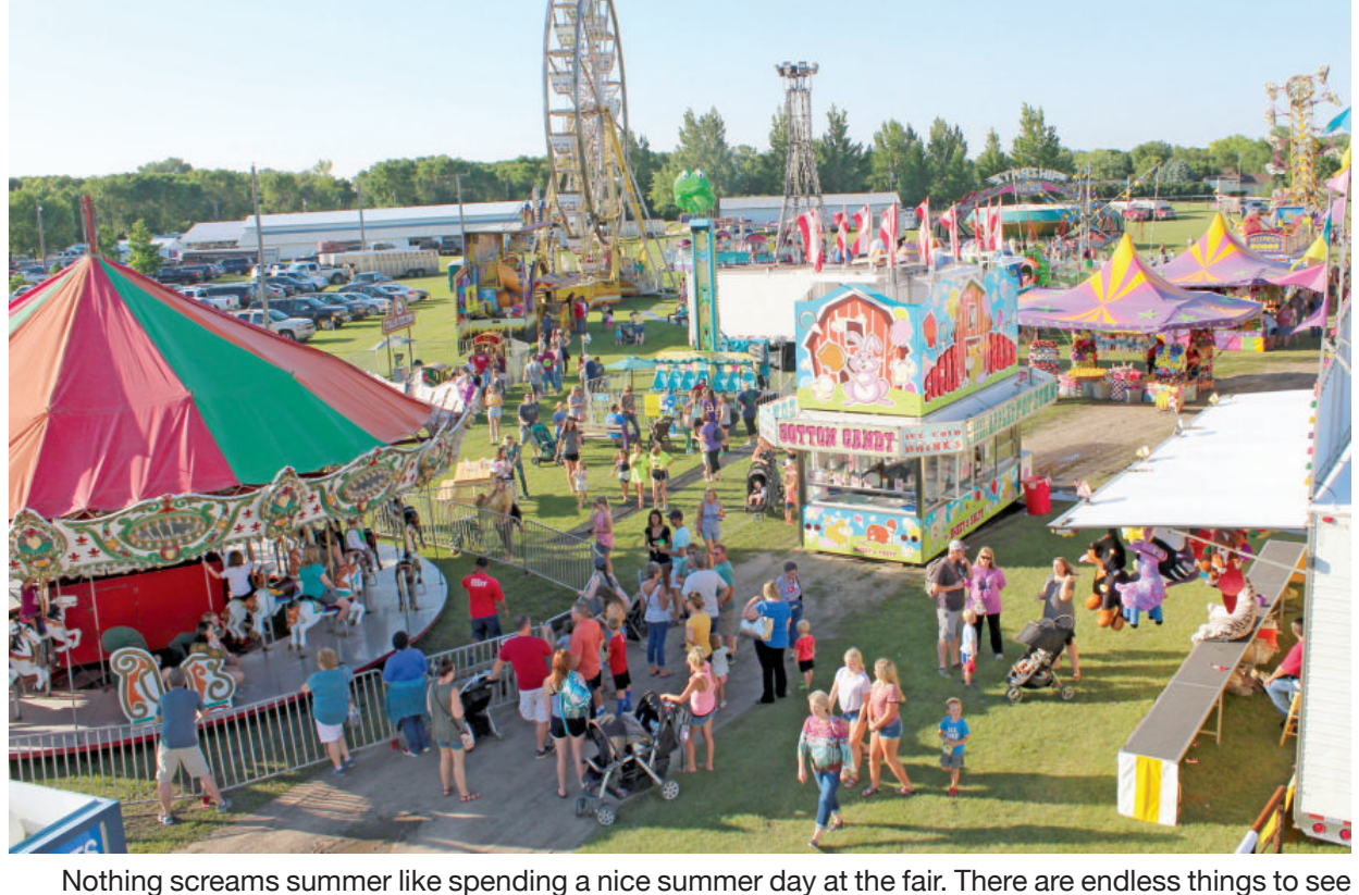
and do at the Clay County Fair. Whether it's taking a stroll through the animal barns, checking out various artwork, photography and baked goods, or even stopping and taking a break watching some of the free entertainment on the band shelter stage, the Clay County Fair has an abundance of things to see and do.

One thing that always goes with a county fair is the food. Come