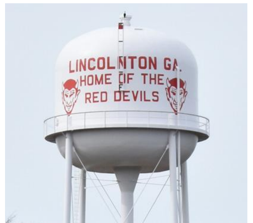
The refurbishment of the Drinkard Street water tank is complete including a fresh coat of paint on the "Home of the Red Devils" signage.