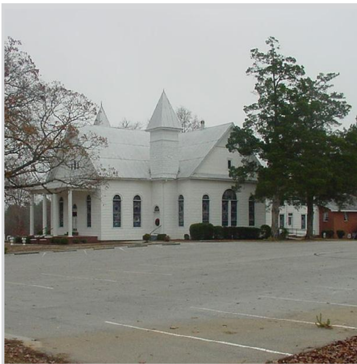
New Hope Baptist Church