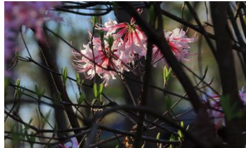
Known also as honeysuckle azalea it falls into the genus Rhododendron.

Consider taking a hike through woods. Look for the bright pink and white wild azalea. You won't see, I daresay, the gnawed bones of men half grown over with moss but you might spy wild azaleas. They're out there just as they were in Bartram's day although manmade reservoirs cover much of their habitat today. We love our Asian azaleas but our native azaleas are just as lovely. Walk through the woods, do some forest bathing, as it's known in Japan. Bartram did. You can too.