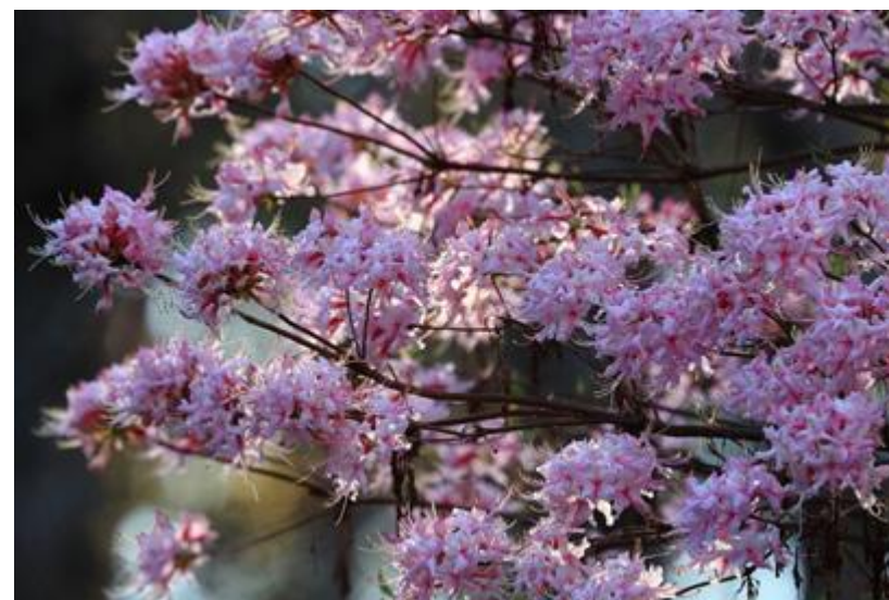
In yards and gardens we see landscaped vistas with plants placed just so to coordinate and maximize their appeal. Out in the woods, however, seen by few, blooms a spectacular plant, the wild azalea.

Price Grove Baptist Church members are reminded that they are able to mail in their tithes to Price Grove Baptist Church, P.O. Box 916, Lincolnton, GA 30817.