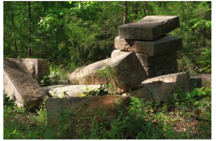
In Chester County at Landsford Canal you'll see the early 1800's handiwork of Irish stonemasons who crafted the canal's guardlock that lowered boats into the canal during floods.

Badwell Cemetery's stone blocks came from a local quarry but I have yet to find it. I hope to. Could be it's beneath nearby Clarks Hill/Strom Thurmond Lake. If I find that quarry, I'll have yet another story about the French, many who came here to die in the mid to late 1800s.