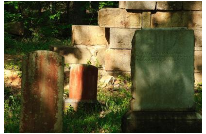
The right front wall of Badwell succumbed to gravity and toppled into the cemetery

As the Huguenots, led by the Reverend Jean Louis Gibert, built and oversaw the building of Badwell plantation, its springhouse, and cemetery, the sounds of mallets and chisels rang out. Hoists groaned and creaked as men struggled to put the stones in place. I don't know how much those stones weigh but I know no one man can lift one. Metal straight edges flashed in sunlight as stonemasons perfected and aligned blocks. They might have fashioned a lewis and used it combination with a block and tackle. Let lewis pick 'em up. A lewis, that's a device that grips