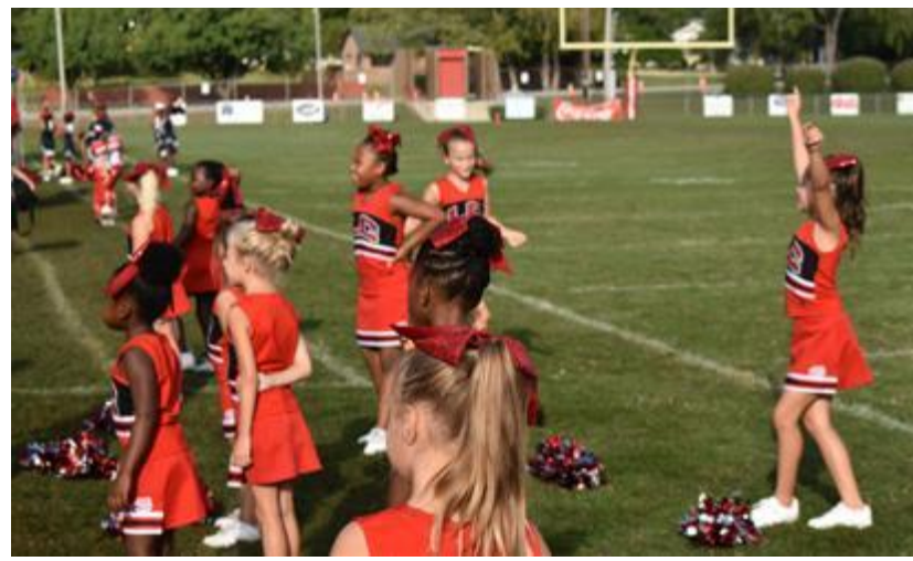
The final day to register for Pop Warner cheerleading will be this Saturday.