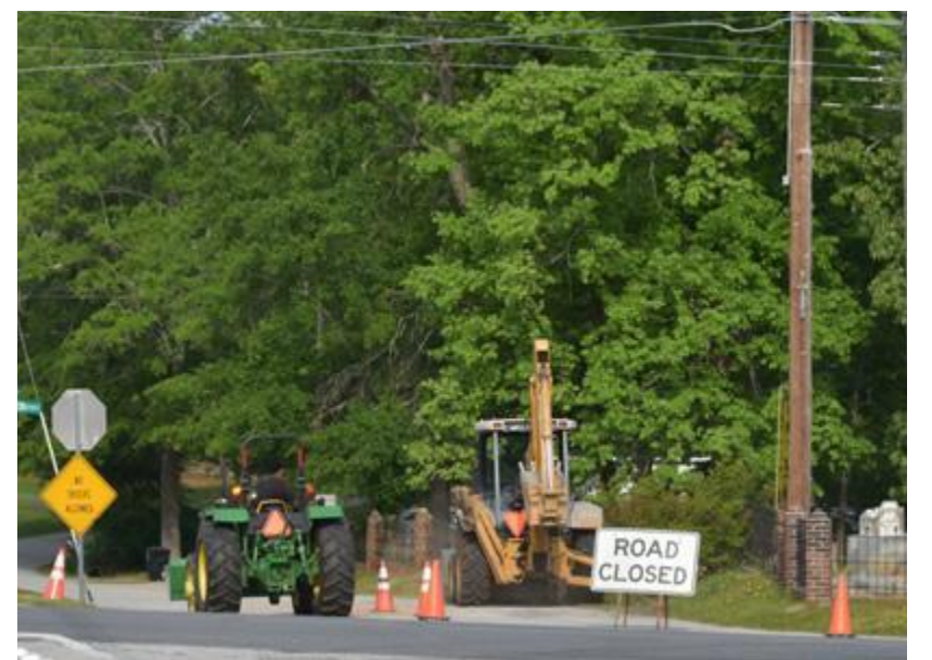
City of Lincolnton road crew recently completed repairs on Elam Avenue.

Moving on to other reports, the council reviewed the monthly planning and zoning report by Building and Code Enforcement Officer