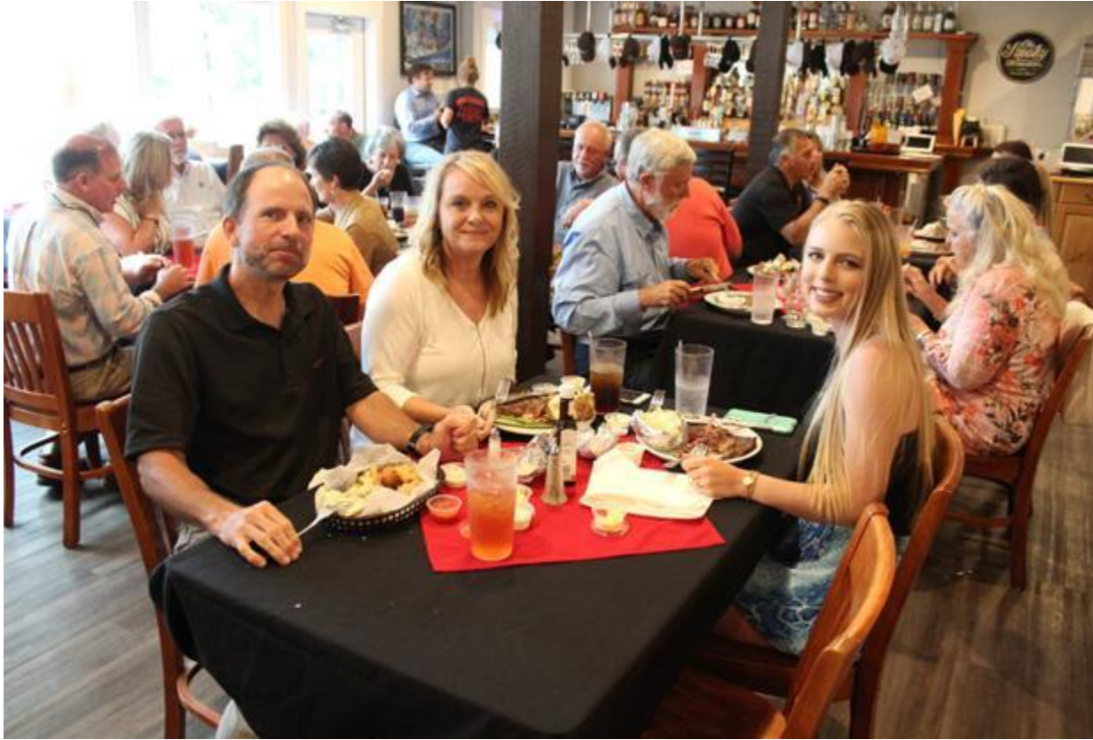
The Lincolnton-Lincoln County Chamber of Commerce hosted a large number of attendees at its annual Chamber Banquet held recently at Williema's Restaurant.

Vol. CXXVIII, Number 29 • P.O. Box 399 – Lincolnton, Georgia • Publication No. 313-660 • 8 Pages • July 22, 2021