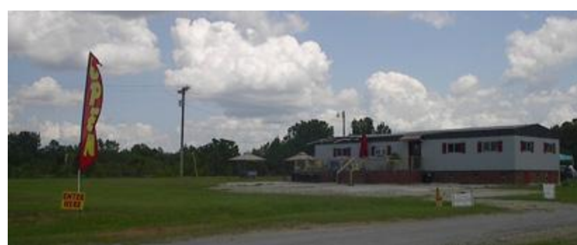
Papa's Old South Café is located at 2634 McCormick Hiwy is now open.

The restaurant is now open for take-out and inside dining 7 days a week with