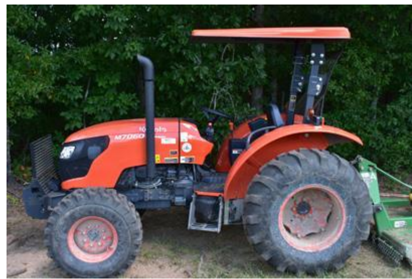
New Kubota tractor replaces unit damaged in rollover accident.