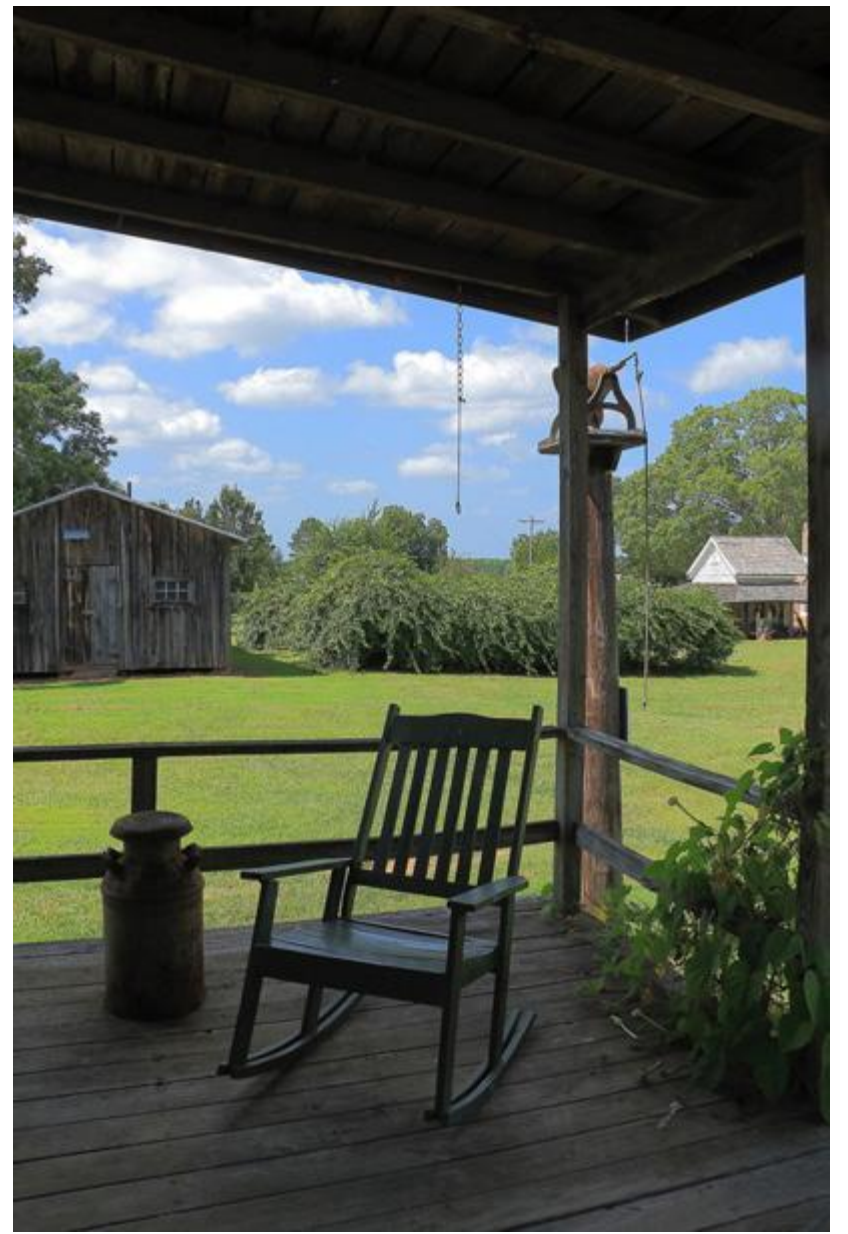
A rocking chair sit sona porch by an old milk can.

I'm a big college football fan. Back on January 11, 2021, after Alabama clobbered Ohio State for the national championship, I turned my TV off for 231 days. I didn't turn it on until August 30 and only then