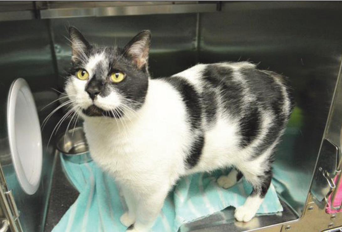
Kung Fu is a big bobtail boy ready for a home! This loveable guy is always happy to see you, he could be called the greeter of the room. Kung Fu would love to find someone to keep company for the New Year! Apply at dmcasf.org