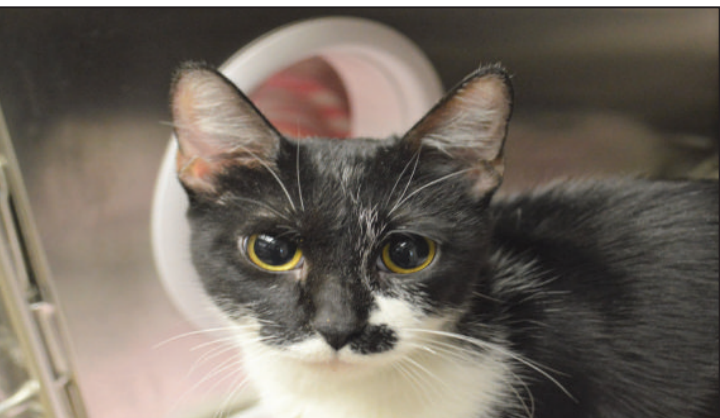
2-year old Jewels is a kitty of few words, not much seems to bother this girl. Jewels arrived at MCAC as a stray and has quickly adjusted to shelter life. Staff has noted that she loves her food and is pretty well-behaved. If she sounds like the cat for you, fill out an application at dmcasf.org