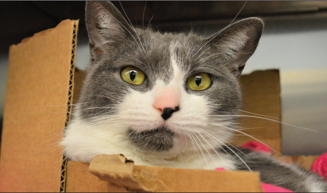
Sweet Piper was brought to us with two other cats (Holly + Ivy). Piper needs someone who will give her a chance and provide her with the love she deserves. Since arriving here, Piper has been on the quiet side not so sure what to think about life at the shelter. While Piper is a bit of a shy girl, she quickly warms up and enjoys pets on her soft fur. Apply for Piper at dmcasf.org