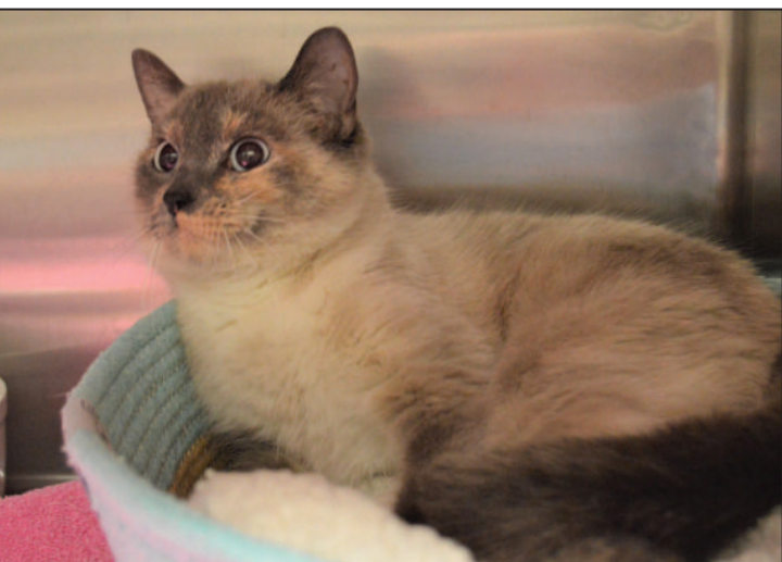
Cala is a gorgeous dilute/lilac tortie point mix looking for a home. She came in as a stray and while she can be timid at first, she loves to show off her biscuit-making skills. During the day, you can often find Cala relaxing in her bed or on her favorite perch. To get an appointment, start by applying for her here: dmcasf.org