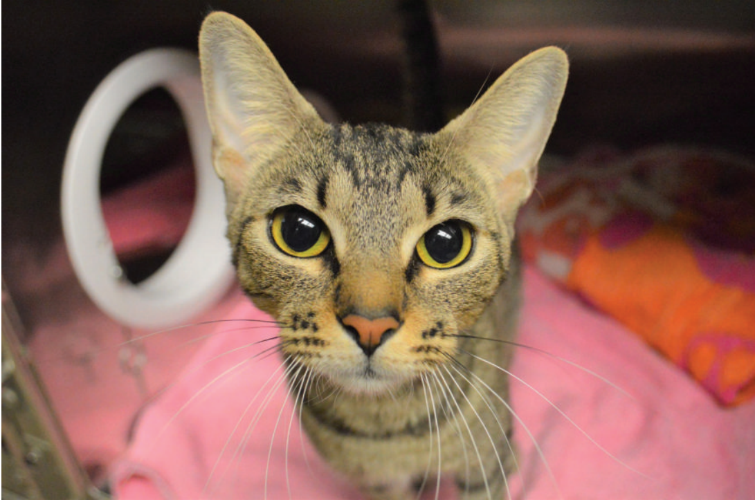
Abella is a very personable gal. At 2 years old she is full of life and thrives on attention. Abella would make an awesome playmate for someone. Apply here: dmcasf.org