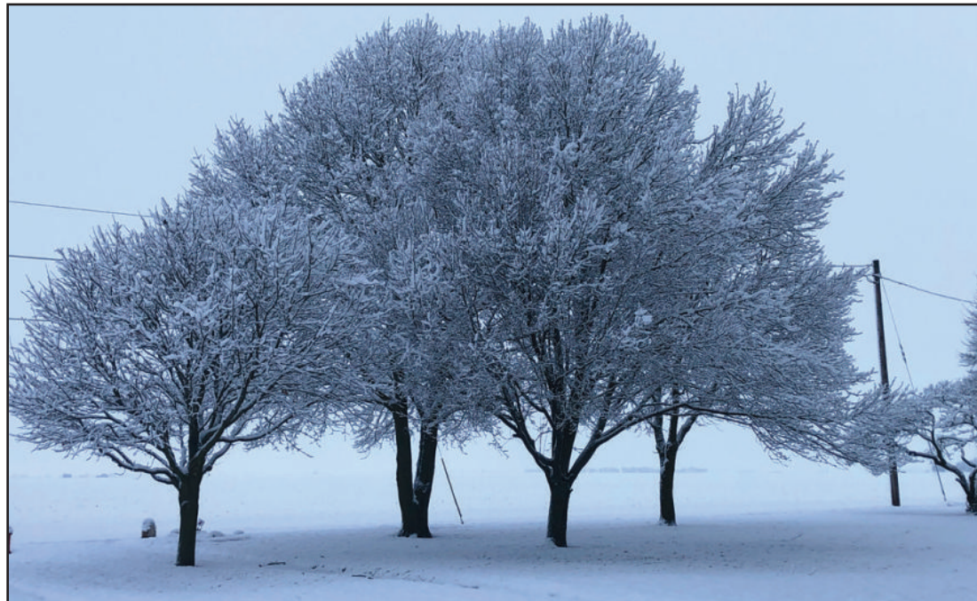
Winter 2021 has kicked off to treat us to a mixed bag of freezing rain, snow, and freezing fog the first three days of the new year. All pictures were taken in Atwood, with the exception of the bottom picture which was taken in Hammond.