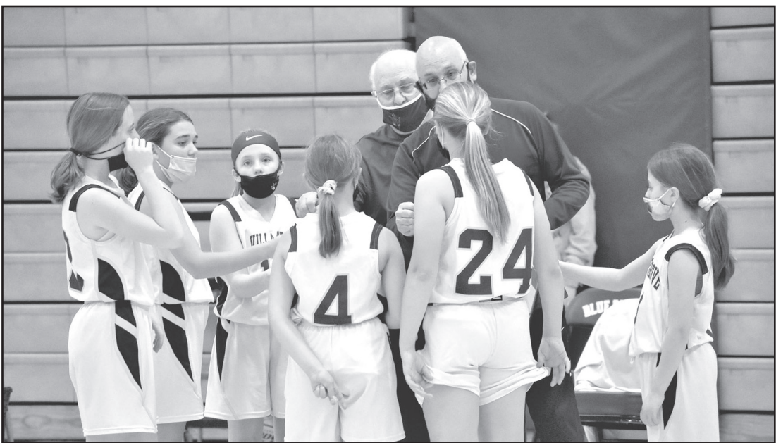
The seventh grade girls basketball team hurdles before their basketball game against LSA.