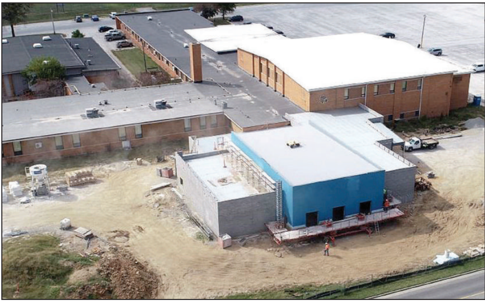
Holland Construction Services is constructing a $4 million addition to Carlyle High School. The project includes a 10,000 square-foot building addition which will consist of a new multipurpose cafeteria and kitchen area as well as offices, bathrooms, and a lobby.

Holland’s own staff grew in 2020. The firm added 10 new employees and lost three, all due to retirement. That means a net of seven, or 10 percent, of the 70 now on board. Many of them are younger project engineers who began as college interns, but also include experienced project managers and field superintendents.