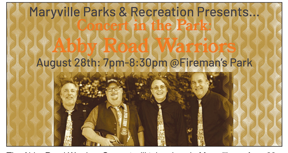
The Abby Road Warriors Concert will take place in Maryville on Aug. 28.