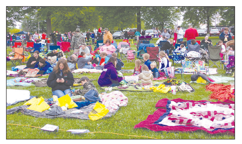
The Troy Family Year of Fun will take place Aug. 20.