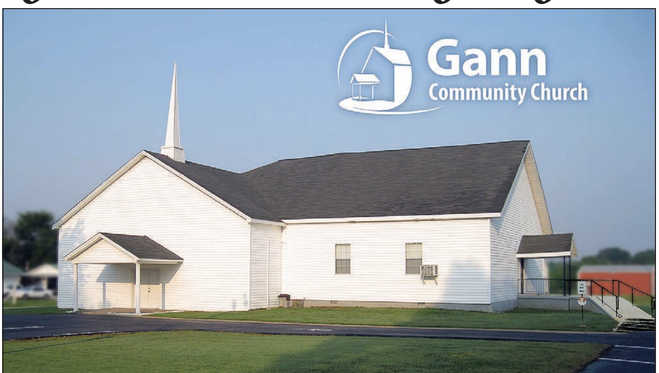
Gann Community Church

Gann Community Church is located at 531 Gann Road in Milan.