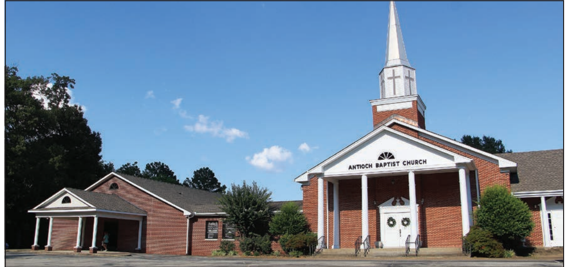
Antioch Baptist Church

In April 1977, the church voted to begin construction of new kitchen facilities, dining room, activities room and gymnasium.