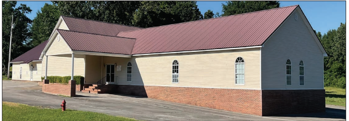
Christ Ministries Church

have one. Bibles are taken to food ministries, nursing facilities and anywhere else God needs a bible, let them know. It would be an honor for them to provide them one. Birth Choice, community celebrations, leads them to go. If you know anyone that