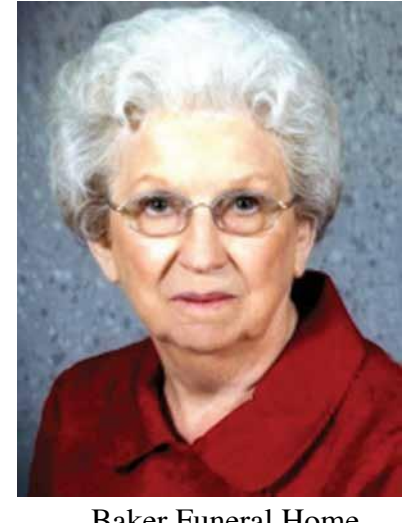
Baker Funeral Home.