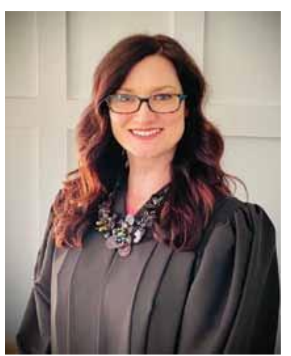
Probate Judge Mary Rathel

nearly 70% of the vote for the Republican Land/panhandle area.