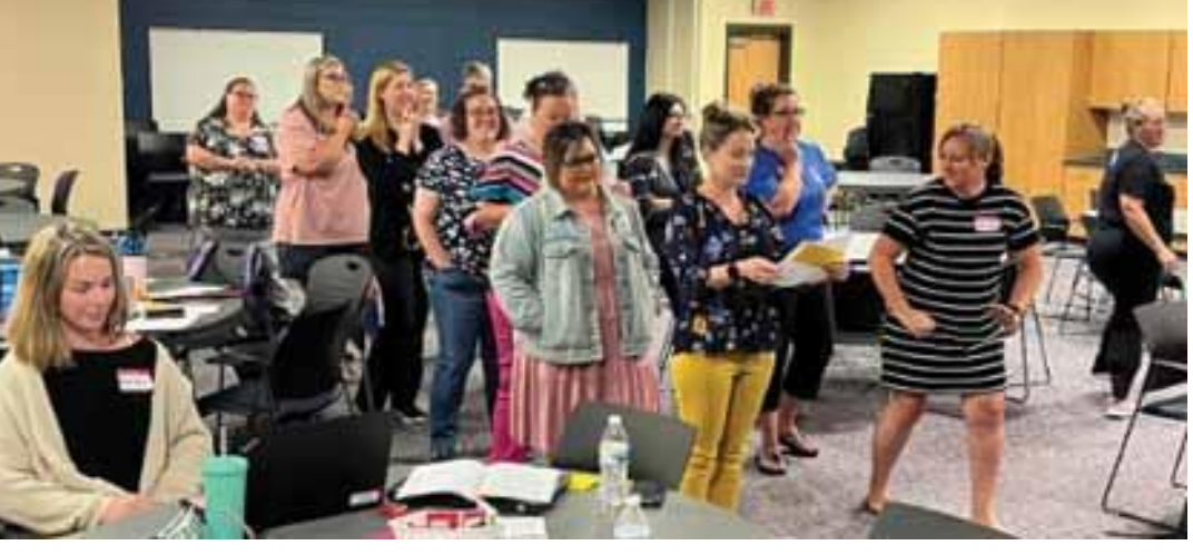
What are your teachers and administrators doing this summer?