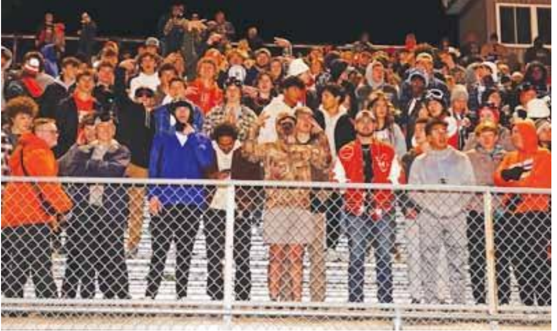
AJ STUDENT SECTION - photos by Gwynn Leaird