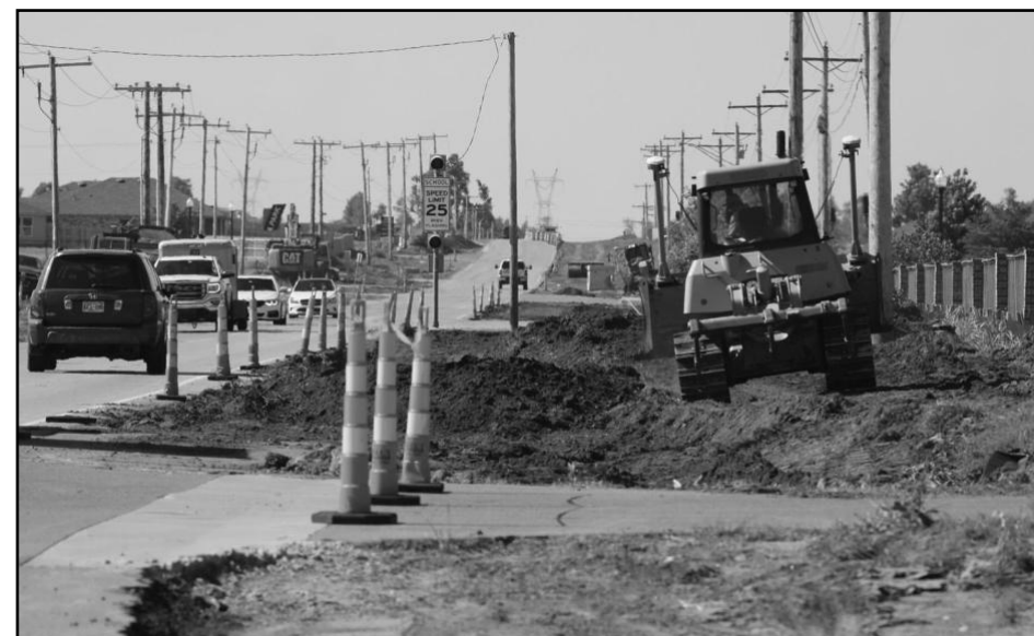
Ongoing roadwork in western Oklahoma City is paving the future of the area's roadways.

For advertising specials email mustangpublisher@sbcglobal.net