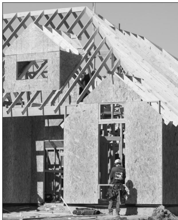
New home construction is ongoing in the new Scissortail Crossing housing addition in West Oklahoma City, along with dozens of other additions in the area.