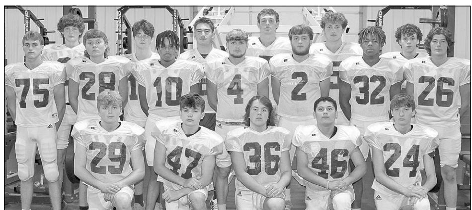
SHEA HAILE / COURIER