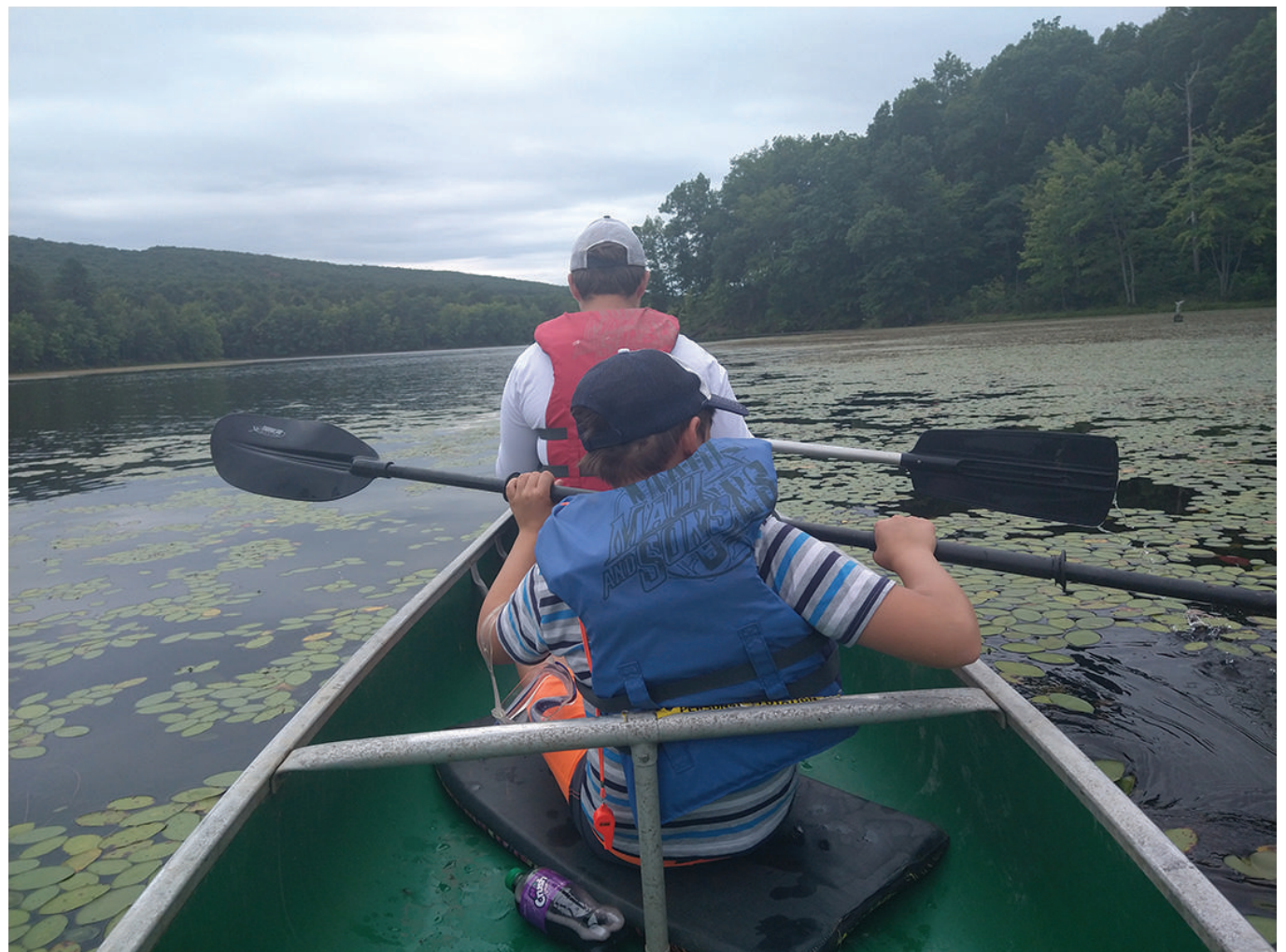
Paddling on Sleepy Creek Lake.

Local swimming holes on the Cacapon River, Potomac River, Sleepy Creek and other small streams are mostly accessed from private property. Check before you go. Be aware of river levels and conditions before you swim.