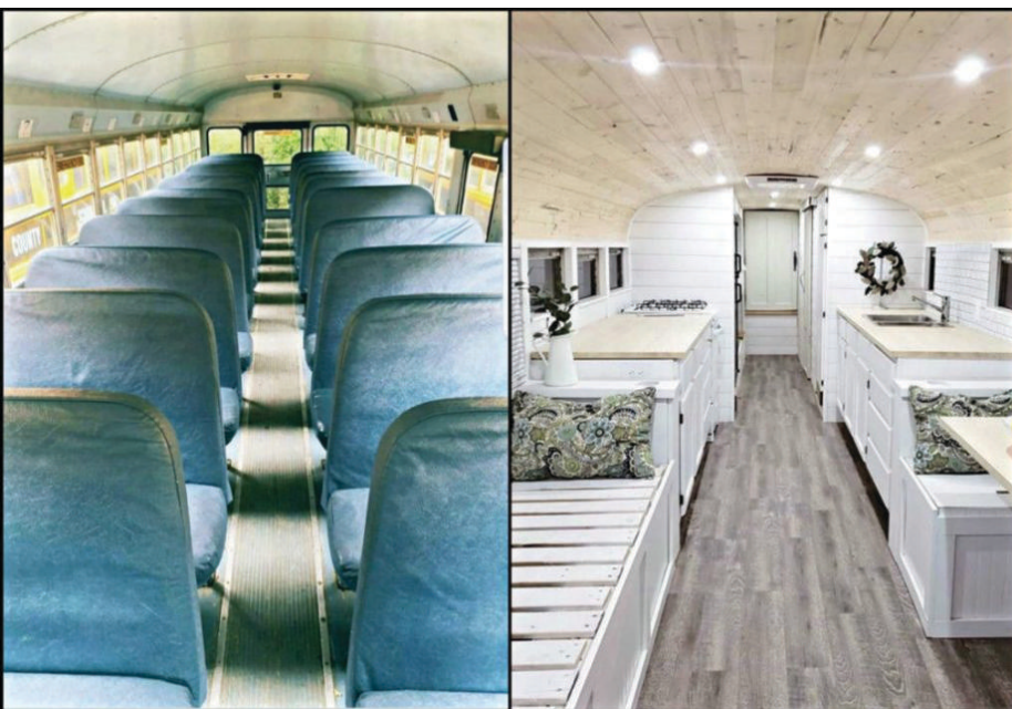
From bus to RV, this photo shows the previous inside, left, and the finished product on the right.