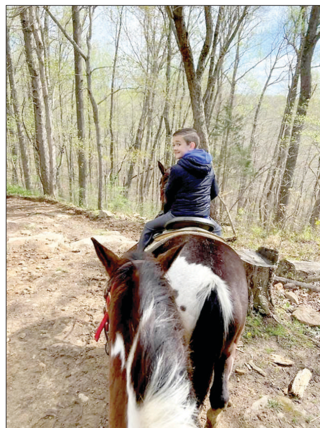
Photo in Mammoth Cave National Park.