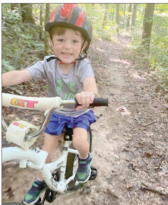
Photo on trail in Mammoth Cave National Park.