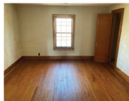
Upstairs bedroom with hardwood floors throughout the home

This 3BR brick home sits on 1.4 acres (lot #3). It has carpet and vinyl floor covering. Large full bath. It has 1500 sqft of living space with central heat and air.