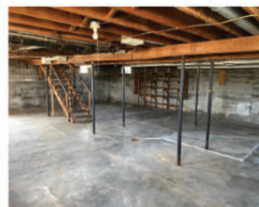
1338 sq ft full basement