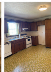
Kitchen with nice built in cabinets