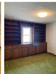
All purpose room with built in cabinets and bookshelves

* Lot #1 is a very nice level 1.003 acres that fronts on 3 streets.