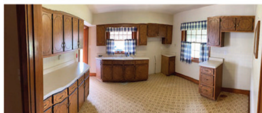
Kitchen with nice built in cabinets