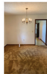
Large dining room

PRELIMINARY - NOT FOR RECORDING OR LAND TRANSFER