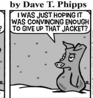
Out on a Limb