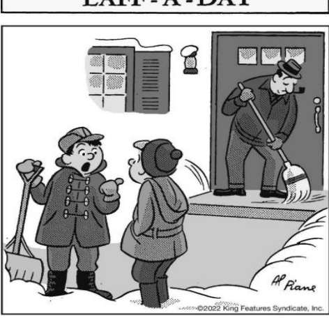
"Just once I'd like to have a job that wasn't harder to do when he was a boy."