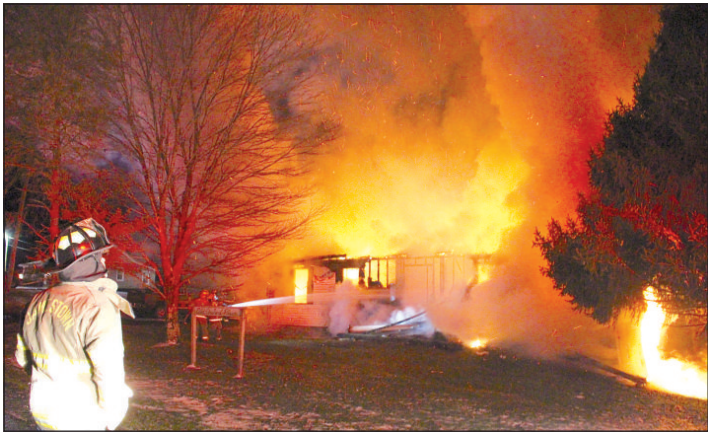
Firefighters from the Jamestown and Russell Springs Volunteer Fire Departments faced sub-freezing temperatures while battling a blaze this past weekend.