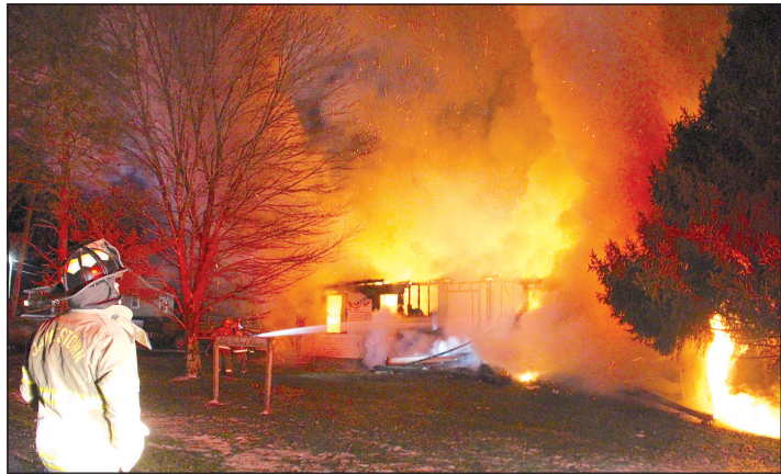
Firefighters from the Jamestown and Russell Springs Volunteer Fire Departments faced sub-freezing temperatures while battling a blaze this past weekend.