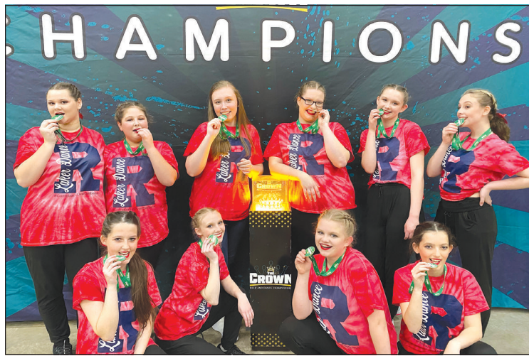
The Laker Dance team hopes for help in pursuing a chance to compete in a national competition.