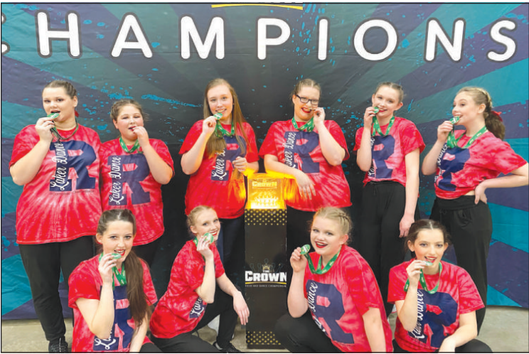
The Laker Dance team hopes for help in pursuing a chance to compete in a national competition.