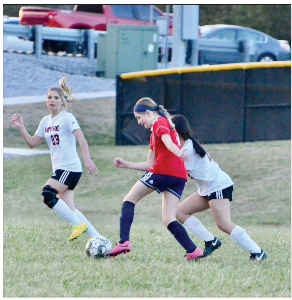
occer teams were in action this