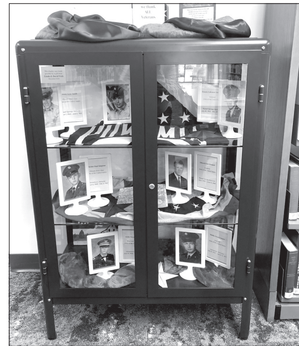
A Vietnam Veterans display is currently featured at the Russell County Public Library.