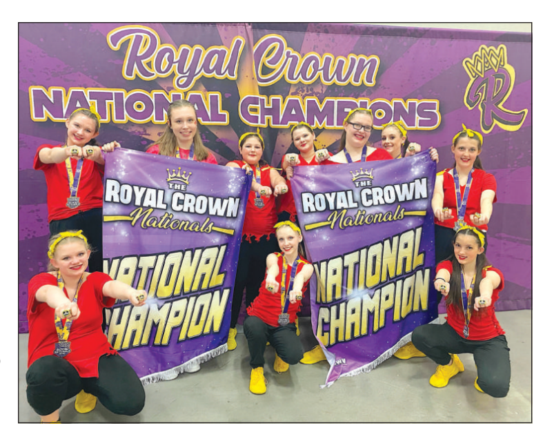
The Laker Dance Team earned two national championship titles this past weekend.

After scores were tabulated, Laker Dance came